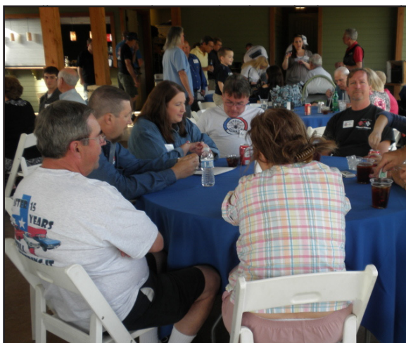
A shot of the crowd at the “Prattberg” table