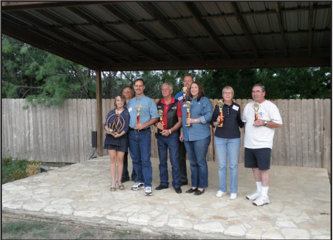
Award winners proudly display their HOT 2011 trophies

This month: Club Meeting to be held at Wings & Wheels on Saturday, May 21st