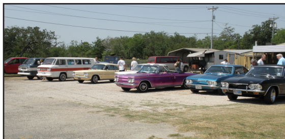
A stop at The Roadhouse in Bastrop in route to HOT

On Sunday, eight CHers gathered for the return trip to Houston including Gail and I. A pleasant and uneventful but scenic drive with a lunch stop at a Bar-B-Que in Giddings. When we stopped, Gail asked me a question – hoping the